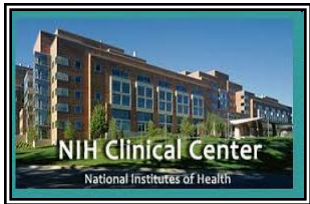
Clinics and Labs